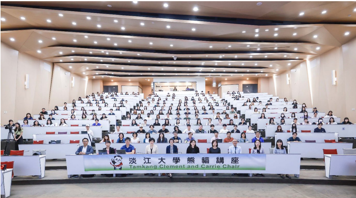
The Clement and Carrie Chair Giving a Public Talk on "Open Science and Its Benefits and Challenges: An Overview from the European Perspective " on May 9 th , 2024