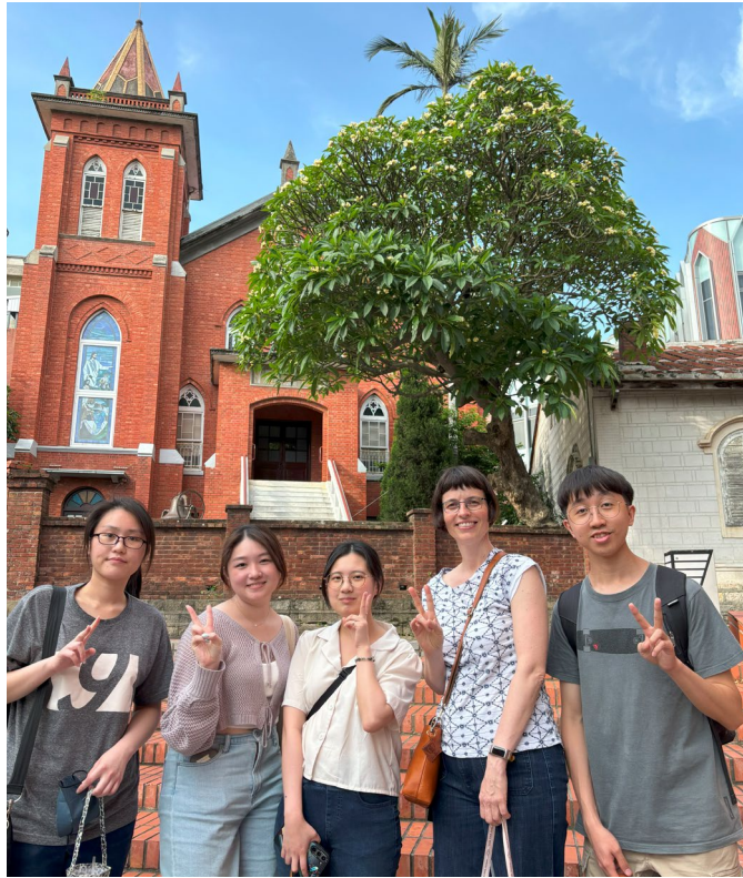
Local Tour in Tamsui with Graduate Students on May 9 th , 2024