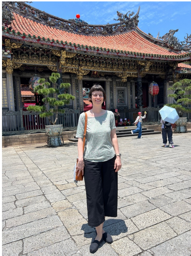
Taipei City Tour to Longshan Temple on May 10 th , 2024