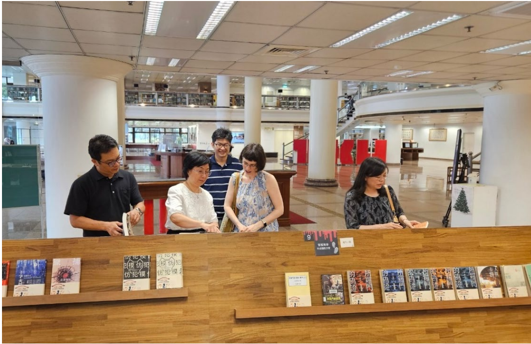
Visit to TKU Chueh Sheng Memorial Library on May 4 th , 2024